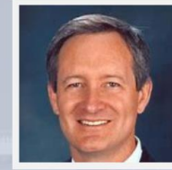
Sen. Crapo (R-ID)