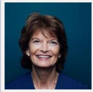
Sen. Murkowski (R-AK)

As of June 30, there are 39 co-sponsors.