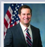
Rep. Moulton (D-MA-06)