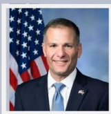
Rep. Molinaro (R-NY-19)