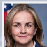
Rep. Dean (D-PA-04)