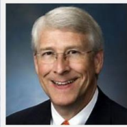
Sen. Wicker (R-MS)