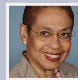
Del. Holmes Norton (D-DC-AL)