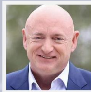
Sen. Kelly (D-AZ)