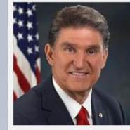
Sen. Manchin (D-WV)