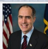
Sen. Casey (D-PA)