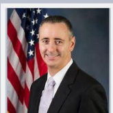
Rep. Fitzpatrick (R-PA-01)

As of June 30, there are 10 House co-sponsors and 3 Senate co-sponsors.